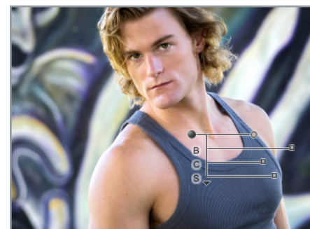
(figure 3) Color Control Point Foreground