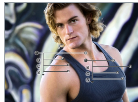
(figure 4) Color Control Point Background